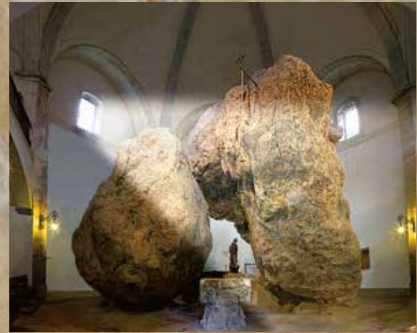
Chapel of San Miguel de Arretxinaga, Markina-Xemein.

Over the centuries, the pilgrims on their way to Santiago have always found shelter in our region. Today the road to Santiago that runs along the Cantabrian coast enters Bizkaia through Lea Artibai. Visitors will be confronted with the spectacular Chapel of San Miguel de Arretxinaga , in Markina-Xemein. Before leaving towards Gernika, the journey takes a stop at Ziortza-Bolibar. Here is the unique Bizkaia collegiate church , the designated national monument of the Basque Country. If this municipality is known for anything it is Simón Bolívar, as it is considered the birth town of the ancestors of the American “Liberator”.