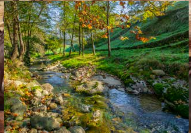
Markola River (Ziortza-Bolibar)