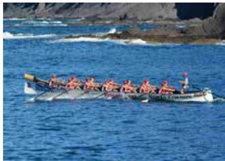
"Antiguako Ama" trainera (traditional rowing boat).