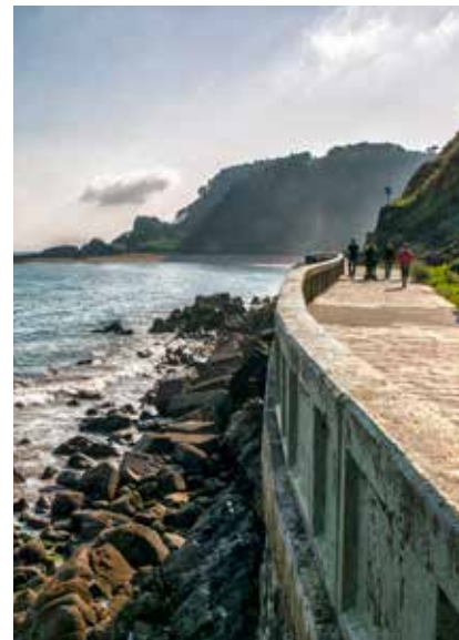
The promenade runs from Ondarroa to Saturrarán.

People from the coast miss the sea when they are away from it. That's not surprising. Who has not relaxed with music of waves breaking against the rocks? Who has not felt the caress of the soft sea breeze on their face? This pleasure will be experienced by those who go to the Lea Artibai coast: the section from Ondarroa port to the Saturrarán beach that borders one of the most beautiful spots on the coastline. Let yourself be drawn by the light from the Santa Katalina lighthouse that can be seen from the road that winds along the cliffs . Take a relaxing break on the broad Karraspio beach after walking along the promenade that runs through the heart of Lekeitio . The twenty kilometres of coast provide an unforgettable journey and an opportunity to discover its most beautiful places in a healthy way. Walk, rest, contemplate, enjoy and return once again to the road.