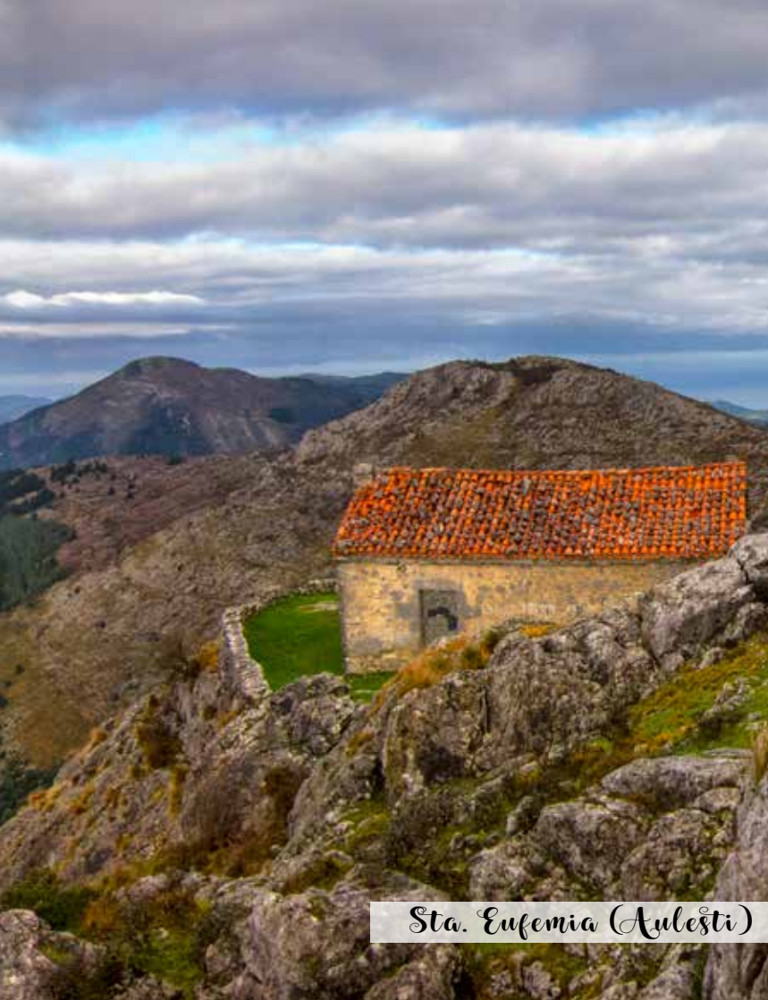
Sta. Eufemia (Aulesti)