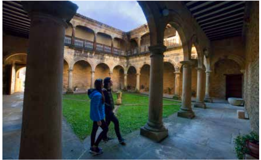
Cloister of the Ziortza collegiate church